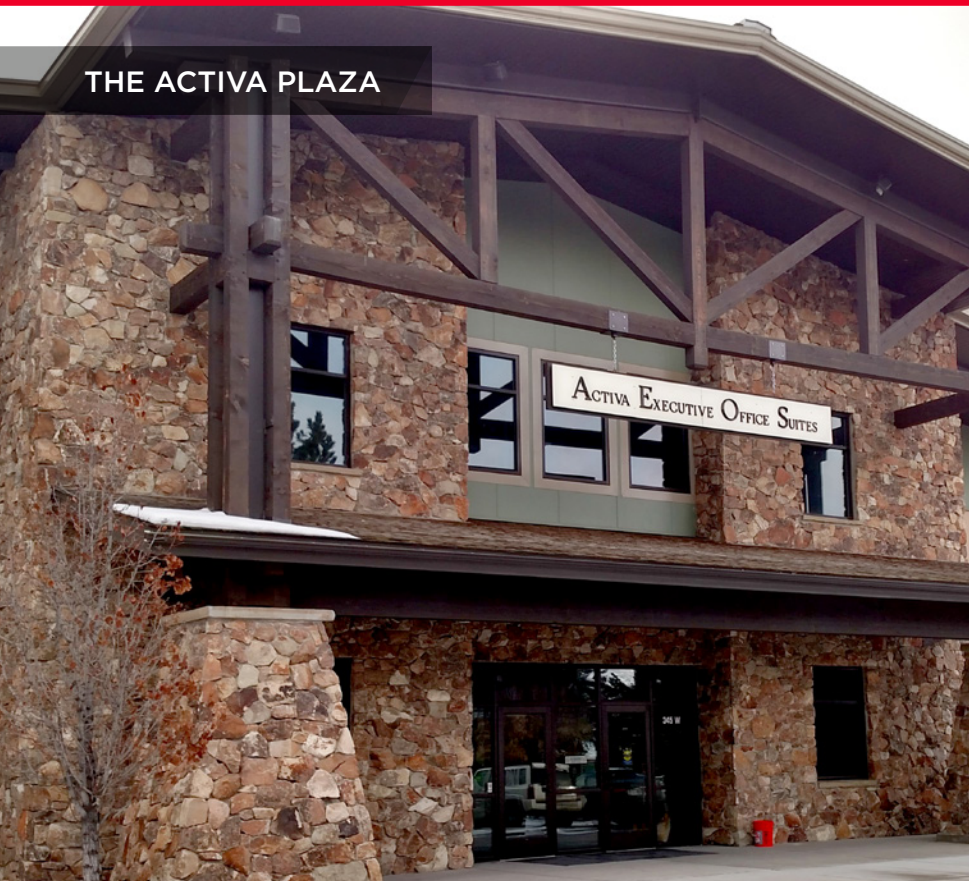
THE ACTIVA PLAZA

Don't waste your time worrying about office bills, services, building maintenance, snow removal, power bills, office furniture, printers, conference rooms, or printer supplies...and the list goes on! Focus on what matters most—your business—let us focus on the rest.