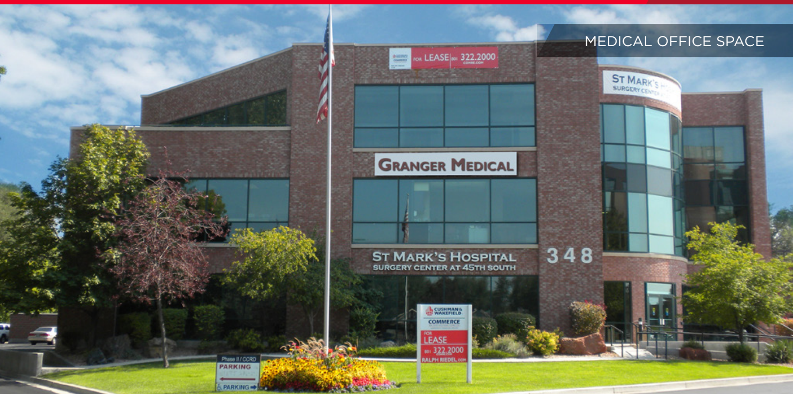
MEDICAL OFFICE SPACE